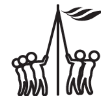
Cooperation capacity building